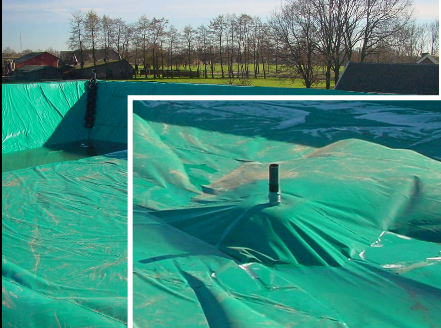
Detail picture of connection of the cover sheet to the floating cushion