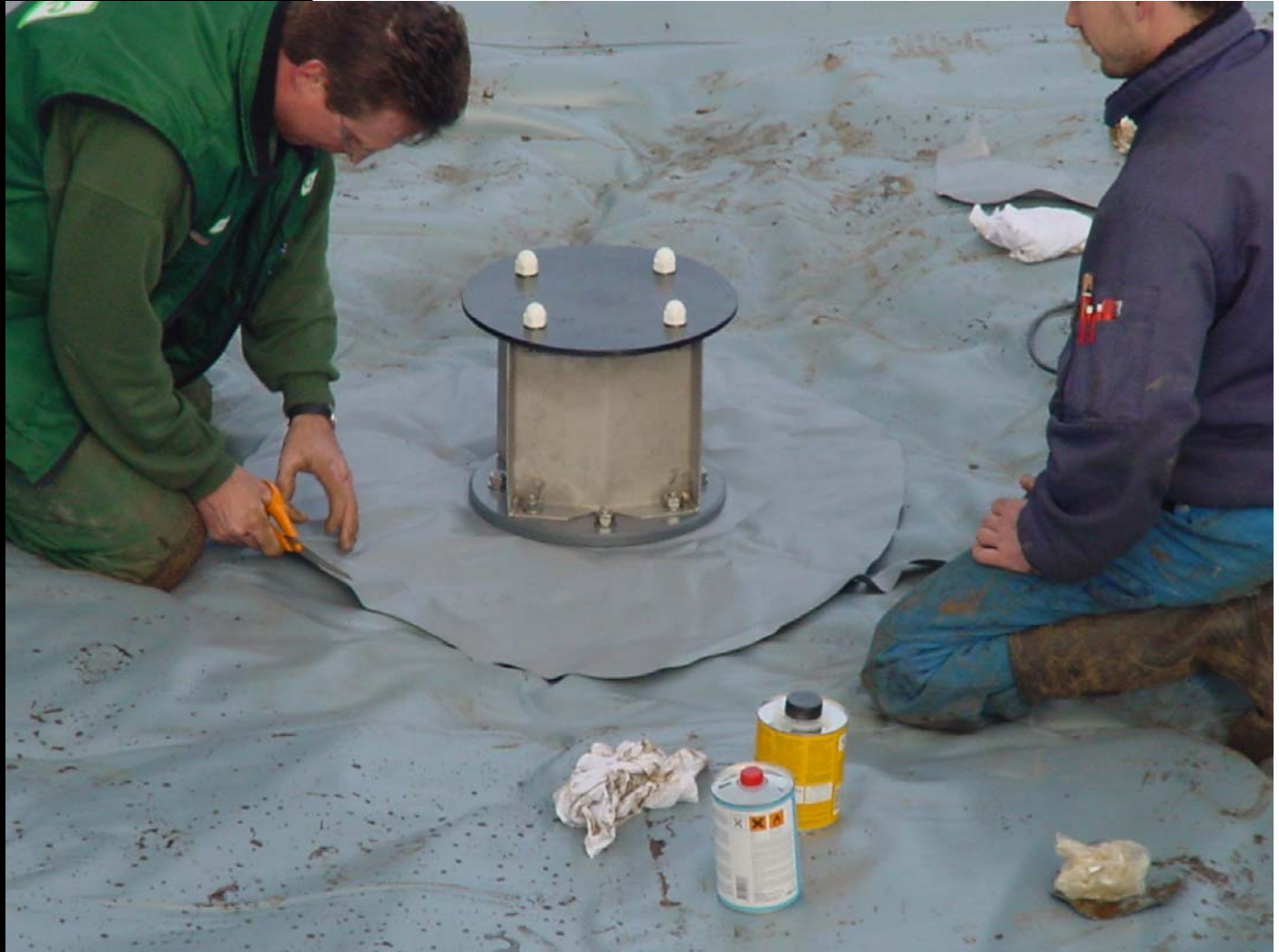
Sealing the Genatex 850-flap to the bottom liner