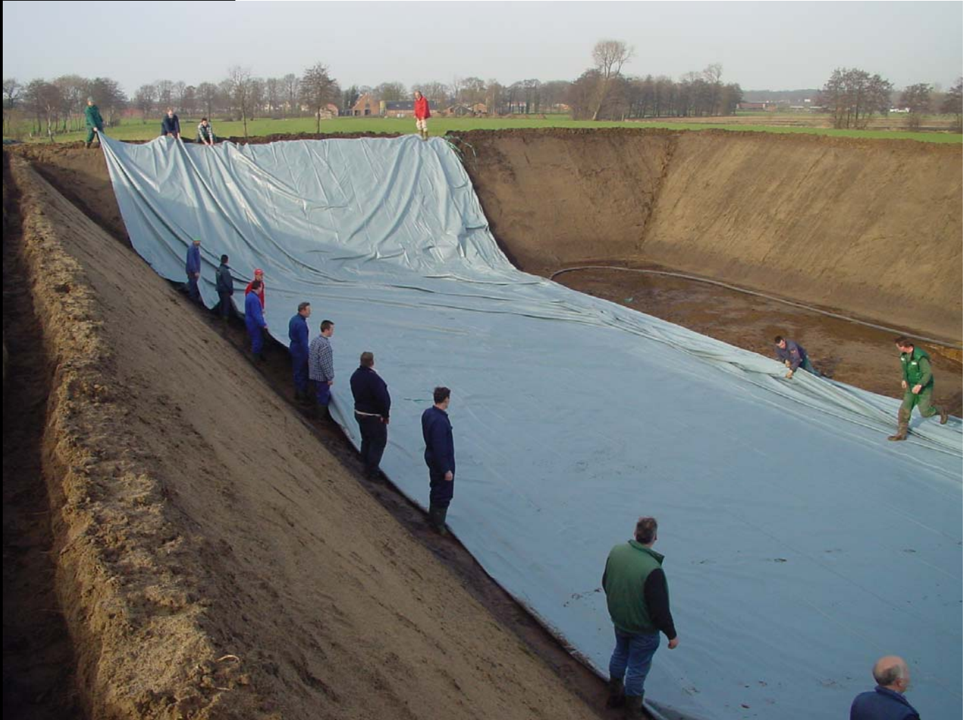
Unfolding the sheet, under supervision of Genap