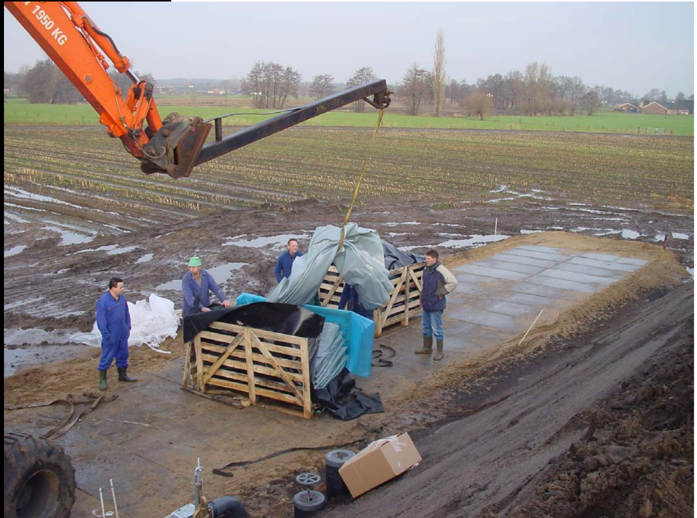
Unloading the Fecatex sheet from the crate