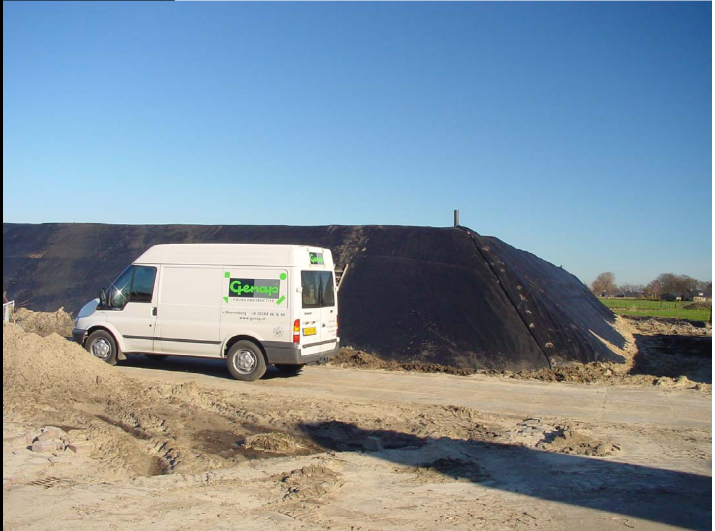
Finished reservoir with bank protection