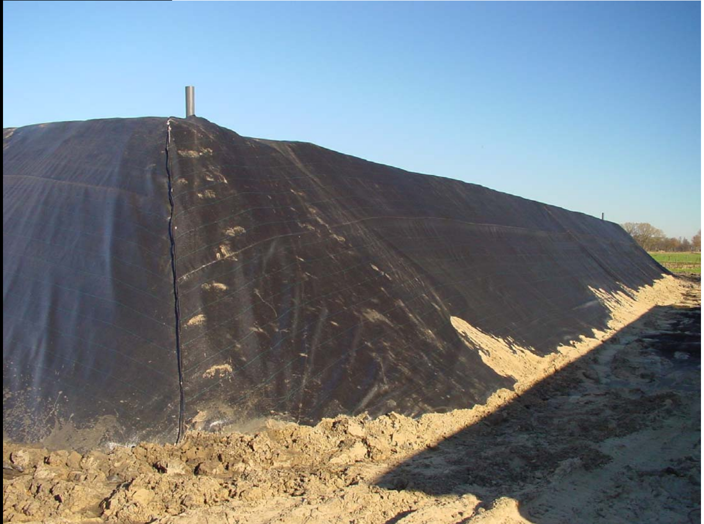
Detail picture of stitched corner