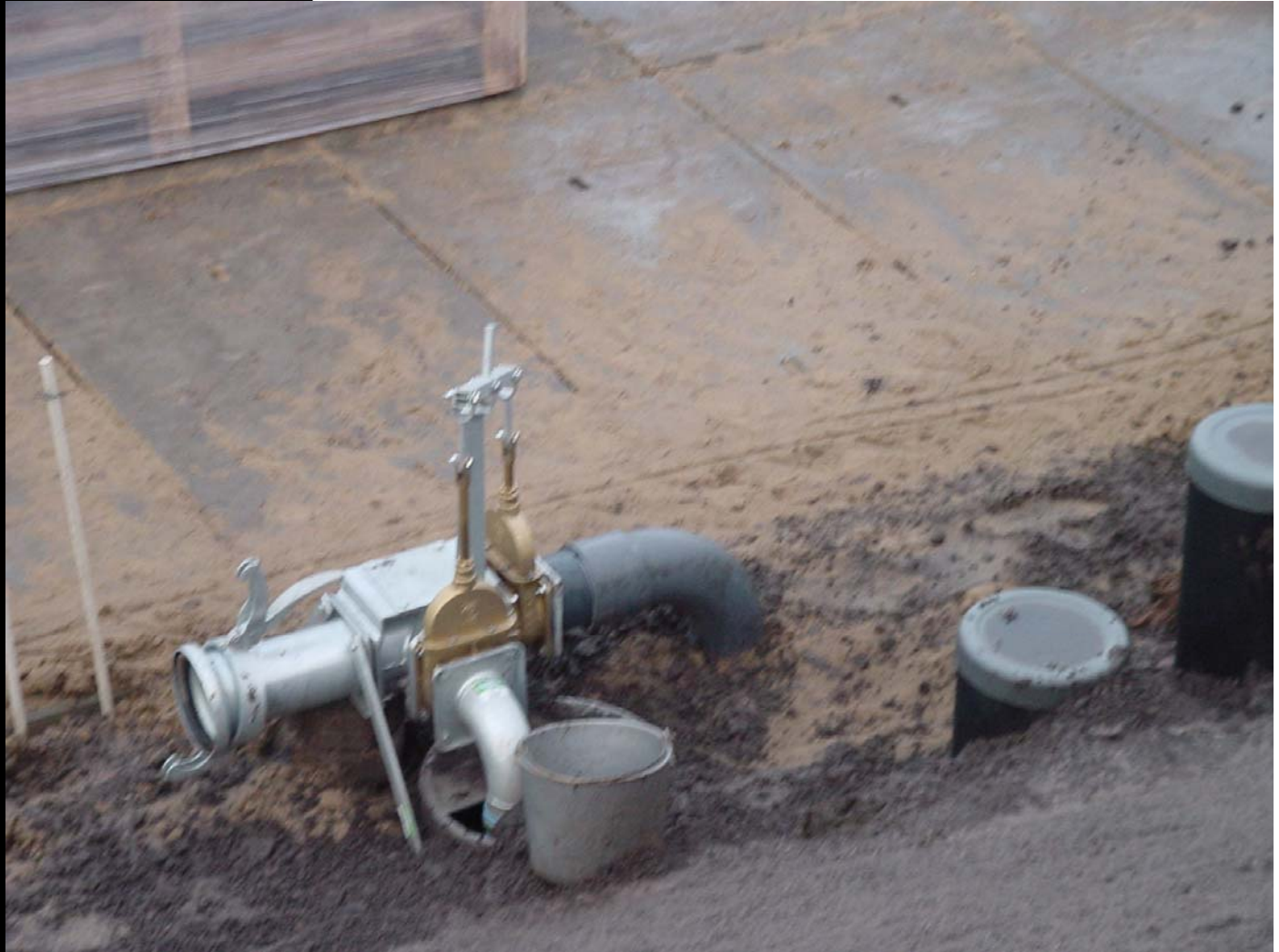
Filling station with in- and outlet piece