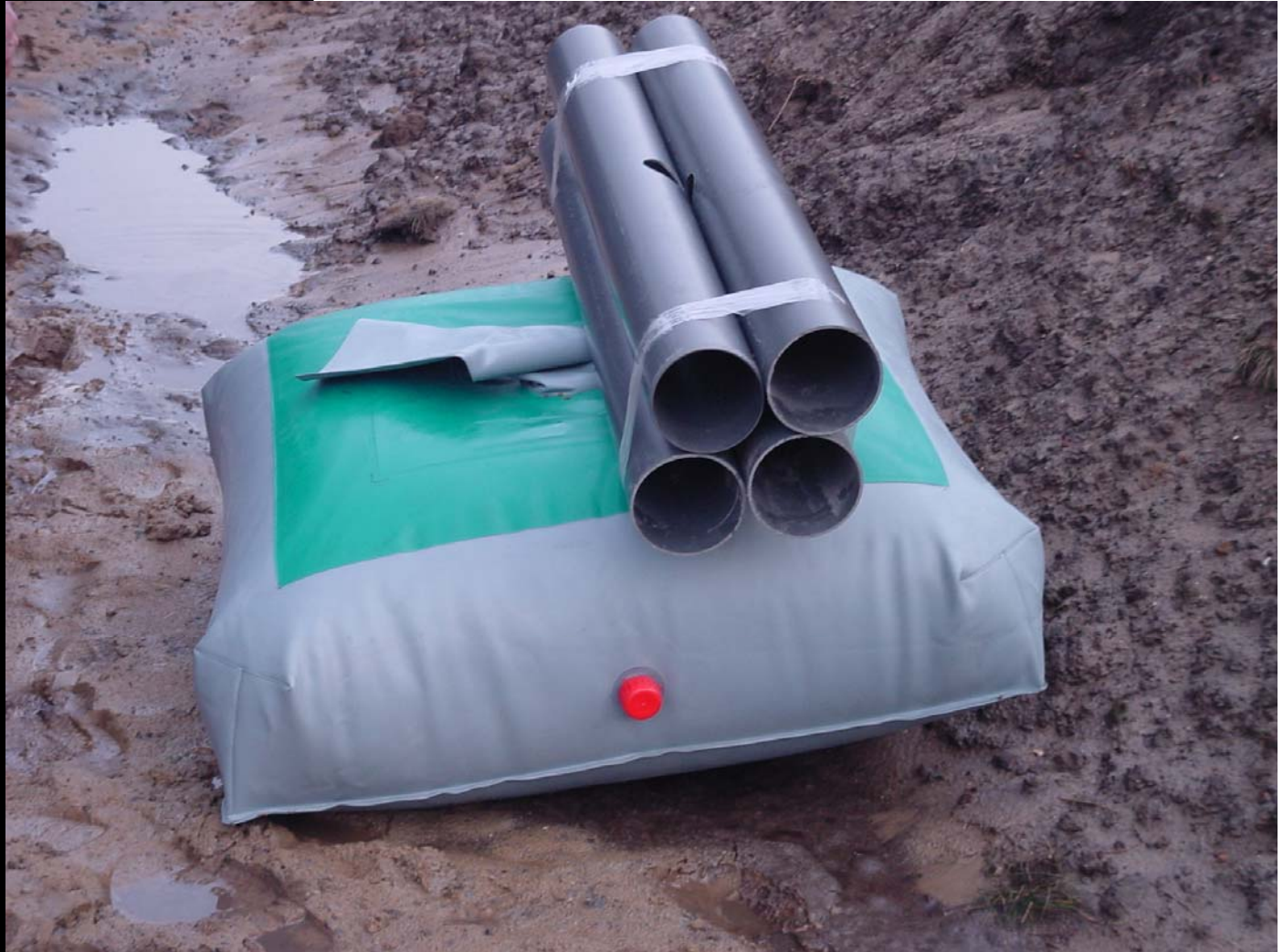
Degassing–floating cushion and accessories