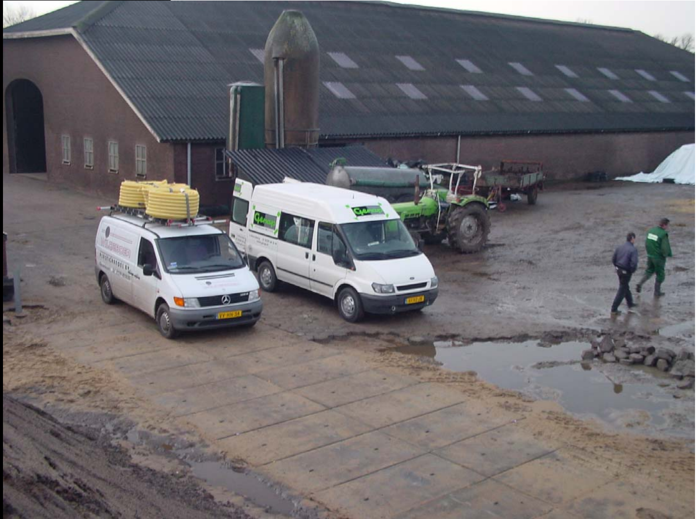
Arrival Dealer and Genap