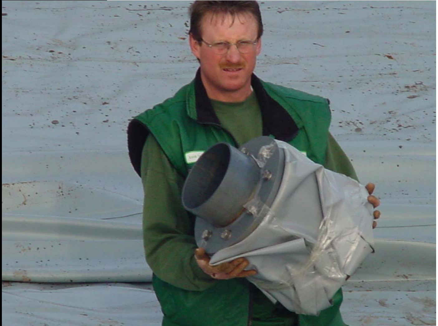
Clamp flange with throttle cap for inlet - outlet of slurry