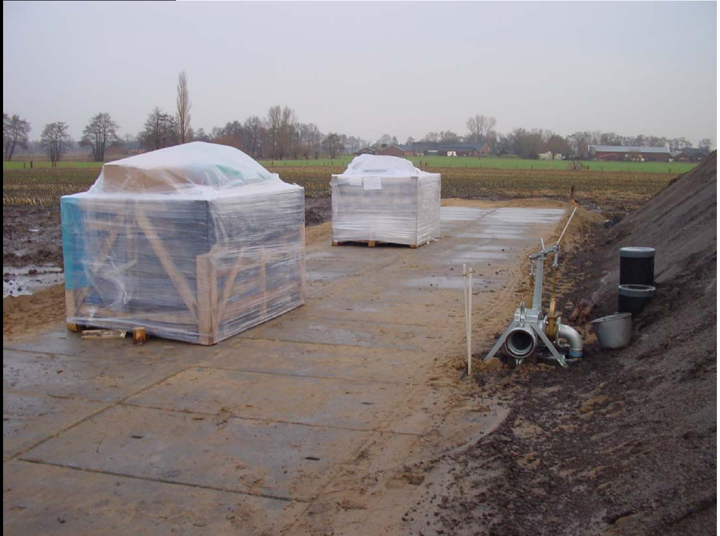
Delivered material in crates