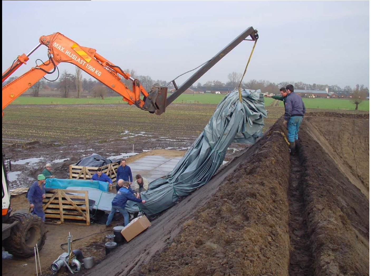
Unloading the Fecatex sheet from the crate